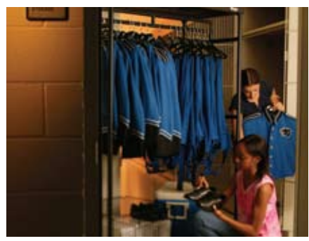
RACK 'N ROLL® GARMENT RACKS

"I was impressed with the scope and diversity of products available from Wenger – they offer a complete package."