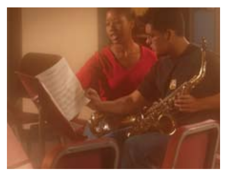
STUDENT MUSIC POSTURE CHAIRS